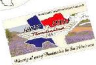
STTC Club Cards