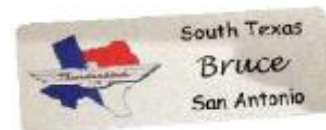
STTC Member Name Tags