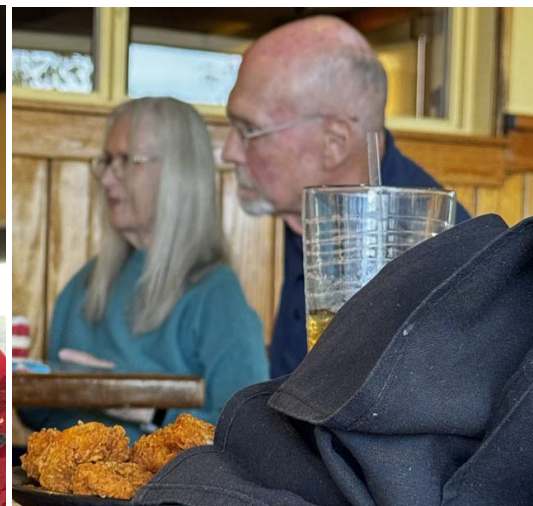
Just a few pix of the Twenty that were present for the Christmas Party! See and enjoy the Video's!